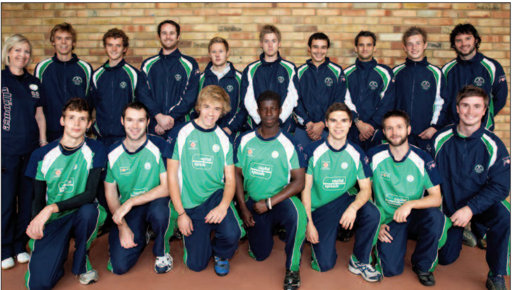
Chelmsford Hockey Club Men's 1st XI