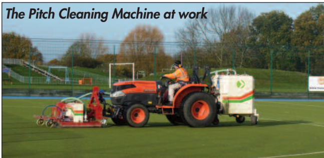
The Pitch Cleaning Machine at work

The water astro has kept us occupied for much of the season with some weeks in November seeing it closed as being too dirty. We have invested –