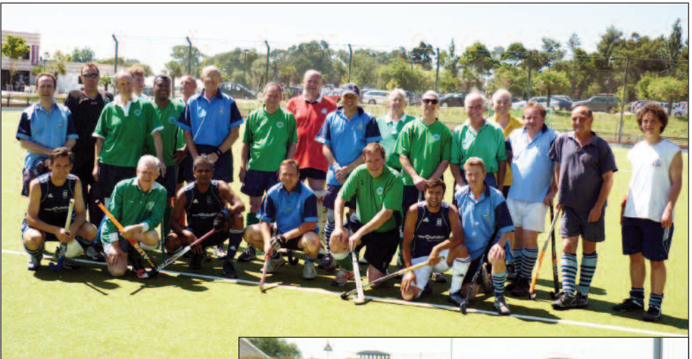
Above. With the hosts.